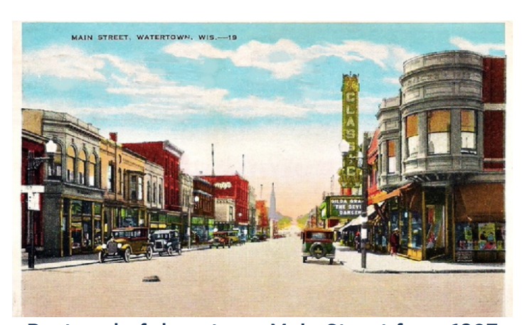
Postcard of downtown Main Street from 1927