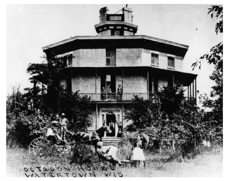
The Octagon House in 1933