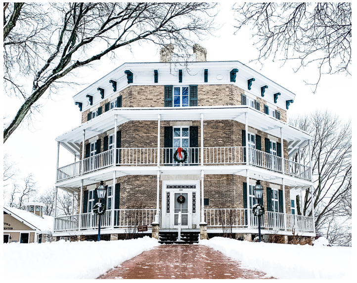
The Octagon House in the winter