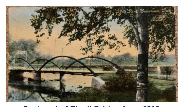
Postcard of Tivoli Bridge from 1910