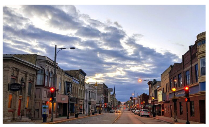
Downtown Main Street Watertown