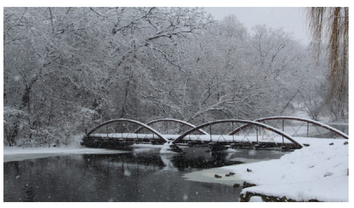
Tivoli Bridge in the winter