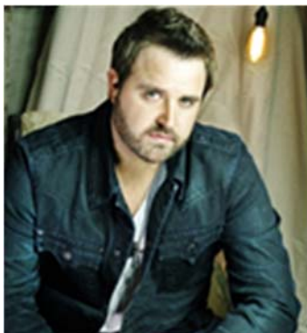
Randy Houser, Main Stage July 13th, 9 pm

Visitors at this year's Franklin County Fair July 11-14, 2013, will be treated to a performance by Randy Houser, singing his hit country song "Runnin' Outta Moonlight" and more. Houser will be performing on the main stage Saturday night, July 13th at 9pm.