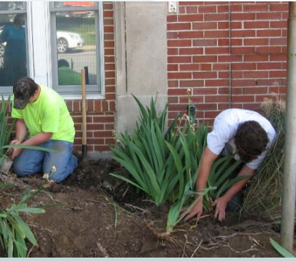
FFA students busy planting for downtown business.