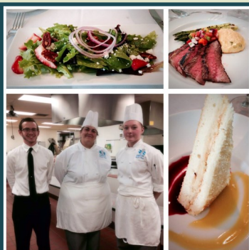
First year ECC Culinary Arts Students prepared and served a delicious lunch.