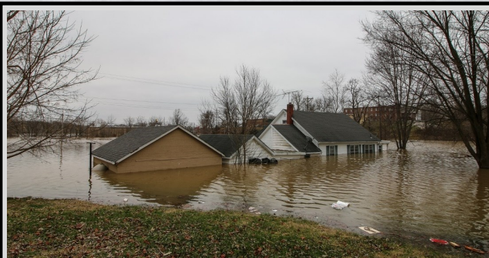
East Main & State Street