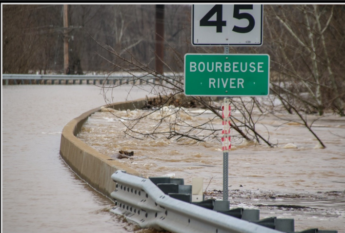
Highway 50 at Bourbeuse River Bridge