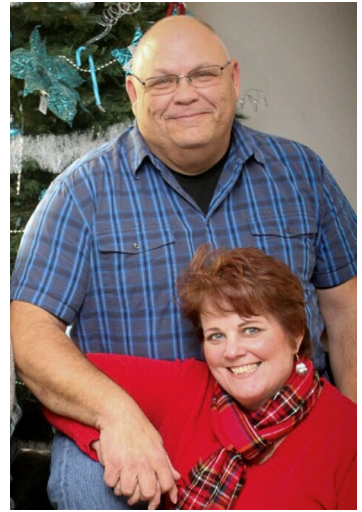
Mayor Rod Tappe

120 deaths in Franklin County attributed to Covid-19 as of 1/27/2021.