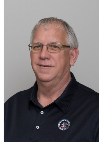
Mayor Robert Schmuke