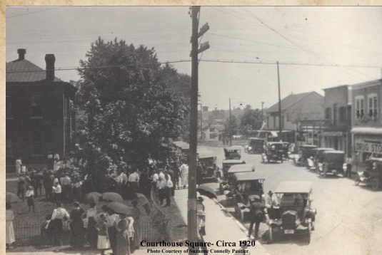
Courthouse Square - Circa 1920