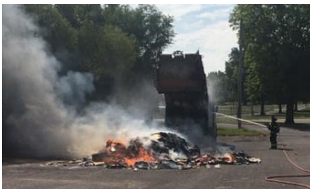
September 8, 2023—Waste Connections and Union Fire Department work to put out garbage truck fire.

We would like to remind all customer to be mindful of the items they are putting in their garbage and recycling containers and the hazards that can occur when flammable materials are improperly disposed of. Things that do not belong in the garbage/recycling truck are chemicals, ashes, paint, lithium batteries, etc