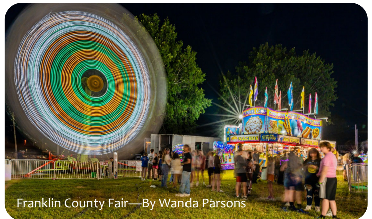
Franklin County Fair—By Wanda Parsons

July 12, 26 August 9, 23 September 13, 27 October 4, 11, 18, 25 November 1, 8, 15, 22 December 13, 28