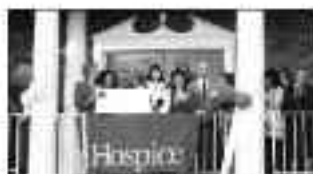
Karen Ann Quinlan Hospice

Let's continue working together to improve the quality of lives in Sussex County.