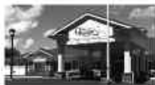
Karen Ann Quinlan Home for Hospice

Your local, Not-for-Profit Community Hospice since 1980