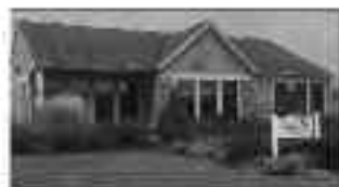
Joseph T. Quinlan Bereavement Center