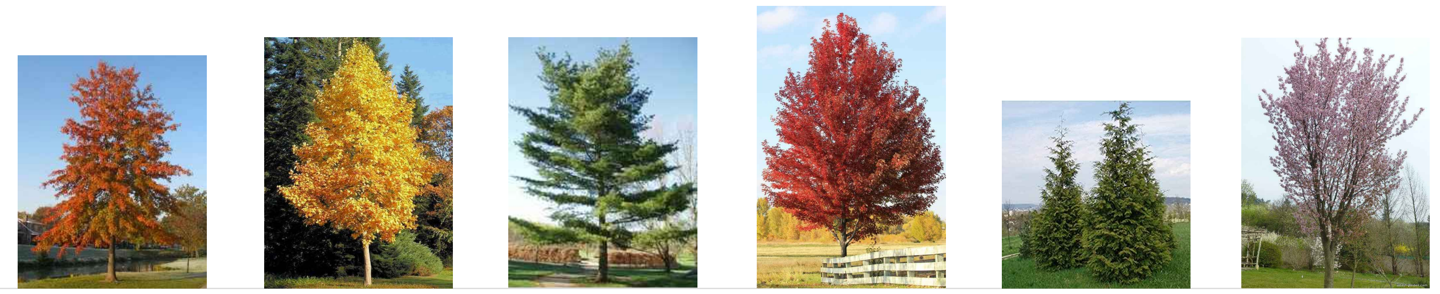
Quercus palustris - Pin Oak Liriodendron tulipifera - Tulip Tree Pinus strobus - White Pine Acer rubrum - Red Maple Thuja plicata - Green Giant Arborvitae Prunus sargentii - Flowering Cherry