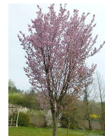
Prunus sargentii - Flowering Cherry