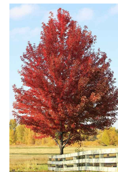
Acer rubrum - Red Maple