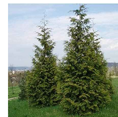
Thuja plicata - Green Giant Arborvitae