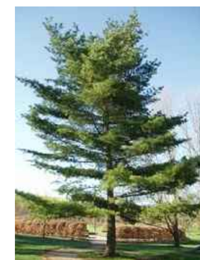
Pinus strobus - White Pine