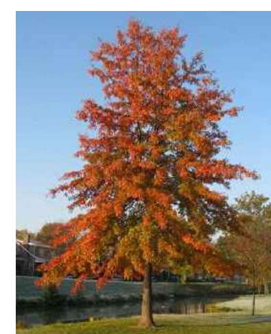
Quercus palustris - Pin Oak