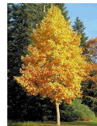
Liriodendron tulipifera - Tulip Tree