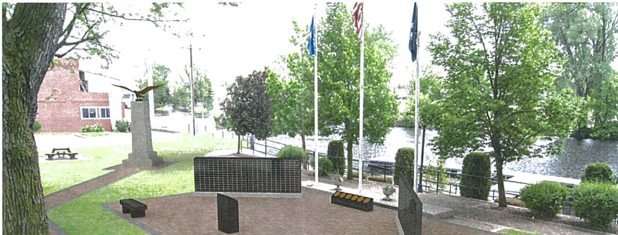
Computerized concept of the Veterans Memorial in Taft Park overlooking the Wolf River