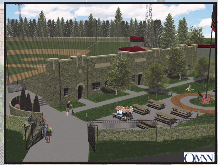
Hatten Stadium Conceptual Design

Check out our ongoing progress online at www.hattenstadium.org or facebook!