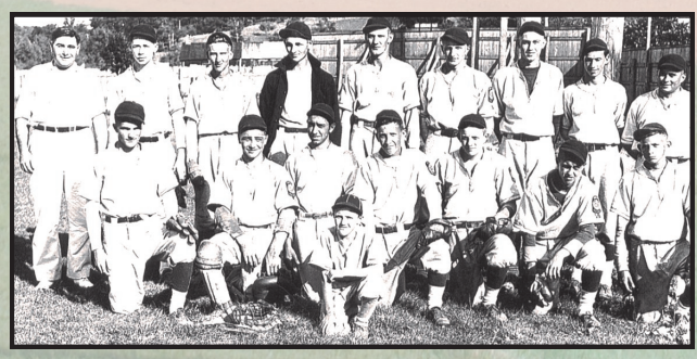
1935 American Legion Baseball Team

Phase 3: Creation of an endowment fund for future Maintenance.