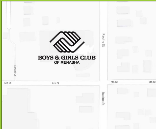
Boys & Girls Clubs of the Fox Valley, Menasha