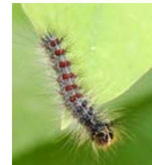
Gypsy Moth Caterpillar