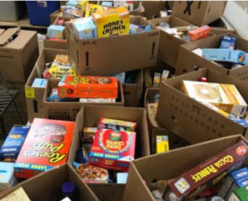
Nearly 200 boxes are distributed each month. Perishable items such as meat, dairy products, eggs, fruits and vegetables are also included.

For more information visit www.community-sharing.org or call 248-889-0347.