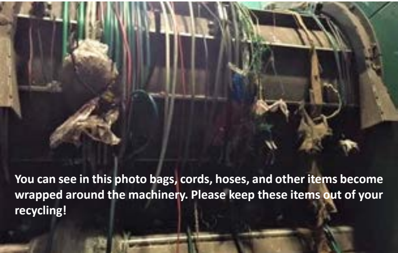
You can see in this photo bags, cords, hoses, and other items become wrapped around the machinery. Please keep these items out of your recycling!

As a reminder, all plastic film products are not recyclable in our program; this includes but is not limited to plastic retail bags, bread bags, zip close bags, shipping supplies such as bubble wrap, Amazon white plastic mailers, paper towel/toilet paper wraps, mulch/wood chip bags etc. These materials cause the same problems as plastic bags. To find out more information about plastic film recycling visit PlasticFilmRecycling.org .