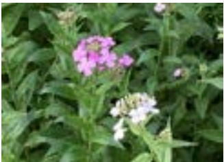
Invasive Dames Rocket

Do you have invasive Garlic Mustard or Dames Rocket in your yard? These plants harm our natural areas. Pull the plants in May and dispose of them in the trash.