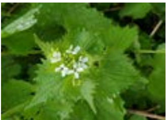
Invasive Garlic Mustard

You may also call or text Norm Werner at 248-763-2497 for more information.