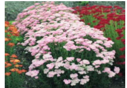
Pink Grapefruit Yarrow