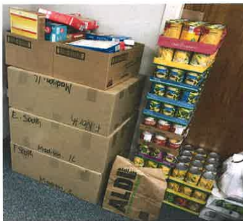
During the month of December the Sheriff's Office hosted an employee food drive. The nonperishable food items were distributed to food pantries in Granite City and Cottage Hills.