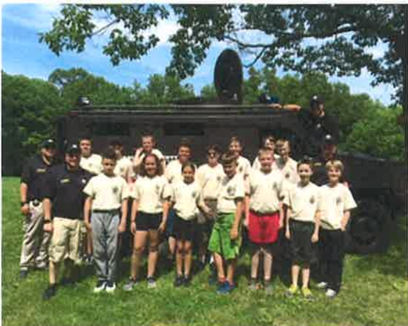
Top: Triad Academy / bottom: Alton Academy

As part of our ongoing commitment to youth, during the Summer of 2018, the Madison County Sheriff's Office hosted its Annual Police Youth Academies. These week long programs have been developed consisting of both indoor and outdoor activities. The goal of the Youth Police Academy is to promote law enforcement knowledge, strengthen the relationship between police and youth, and promote team building and good decision making.