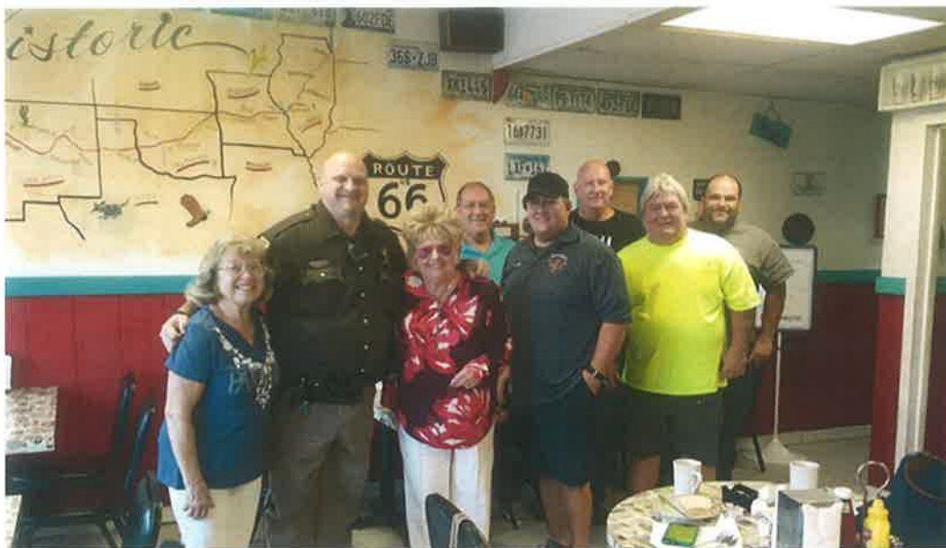
Deputies with the Sheriff's Office enjoyed "Coffee with a Cop" on Wednesday October 4th. The Sheriff's Office would like to thank Itty Bitty Restaurant, Madge's Restaurant, and Mister Donut

During the month of December the Sheriff's Office hosted an employee food drive. We are happy to report just over 1200 pounds of food was distributed to the Collinsville and Highland Food Pantries.