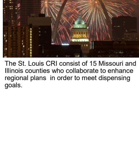
The St. Louis CRI consist of 15 Missouri and Illinois counties who collaborate to enhance regional plans in order to meet dispensing goals.

The St. Louis CRI is the first in the U.S. to exercise the Long-Term Medical Countermeasure (MCM) Dispensing Plan and is receiving interest from national organizations and agencies, such as, ASTHO, NACCHO, ASPR, and CDC.