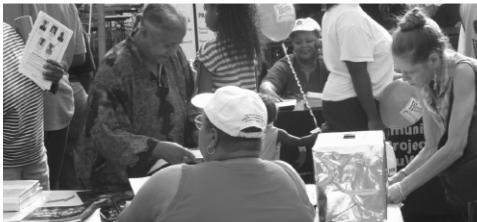
Residents pledged to maintain a smoke-free home during the National CASA Family Day event held last Fall.