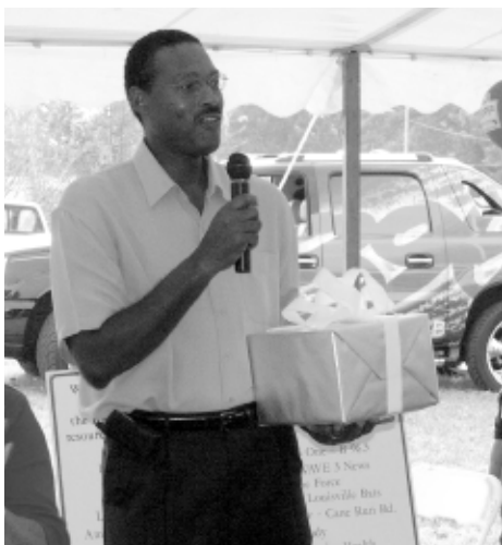
Ulysess "Junior Bridgeman" offered remarks after receiving recognition as an outstanding corporate supporter in the Park DuValle community

"Everyone, at any age should be involved in their communities. Giving back doesn't just mean financial support... it's also an investment of time and energy. By supporting our communities, we are making them a better place to live." So says Dave Thomas, Wendy's founder, and no where is that adage more true than here in Park DuValle. The Wendy's restaurant located at Algonquin Parkway and Cane Run Road has been a major supporter of youth and family oriented programs. From employing local residents to hosting a Report Card Club to sponsoring the annual National CASA Family Day, the restaurant's commitment to this community has been unmatched.