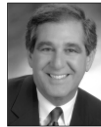
Mayor Jerry Abramson

As we move into our second year of merged government, we are continuing our work to ensure that Louisville Metro is among the most progressive, efficient and effective cities in the nation.