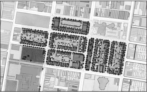
Revitalized Sheppard Square site plan

Sheppard Square’s existing street pattern isolates residents from surrounding neighborhoods. Therefore, reconfiguring the site to where people, resources and vehicles can flow in and out of the Smoketown neighborhood is another major goal of the HOPE VI revitalization plan. To facilitate this process, a barricaded intersection at Hancock and Lampton Streets will be reopened, and the Boxing Glove sculpture, by renowned artist Ed Hamilton, that is currently located at the center of the blocked intersection, will be relocated to a new park-like “Green” parallel to Hancock Street. Two new streets will also be added to help transform the area into a transit-oriented, yet pedestrian-friendly community.