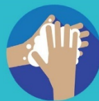
SCRUB: 20 SECONDS