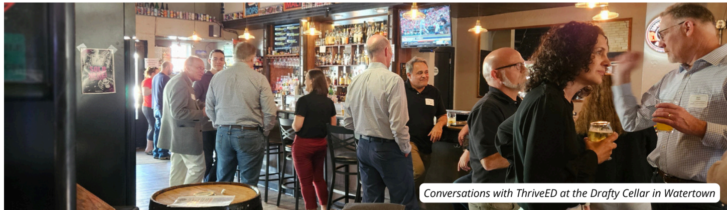
Conversations with ThriveED at the Drafty Cellar in Watertown