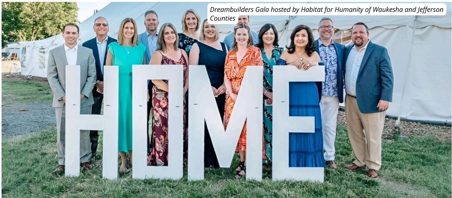
Dreambuilders Gala hosted by Habitat for Humanity of Waukesha and Jefferson Counties

The past year has seen the strengthening of existing partnerships and relationships and the creation of new ones.