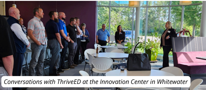
Conversations with ThriveED at the Innovation Center in Whitewater