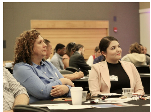
Attendees listen to the keynote address at the Employers "How to Hire" International Workers Conference

In August of 2024, ThriveED partnered with the Jefferson County Human Resources Management Association and other organizations to host the Employers "How to Hire" International Workers Conference, an all-day conference at UW-Whitewater to help businesses grow more confident in hiring immigrant workers and supporting them as employers. The event was a way to learn the best practices when it comes to hiring immigrants, including the cultural nuances and benefits of a diverse workplace as well as ways to encourage success and retention within an existing workforce by considering transportation, housing and language support. The conference was attended by more than 80 attendees.