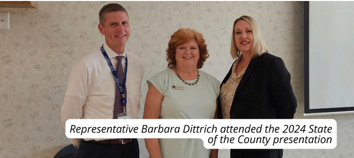
Representative Barbara Dittrich attended the 2024 State of the County presentation