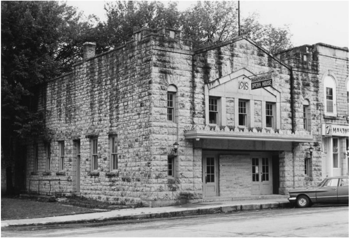
Mantorville Opera House, 1972