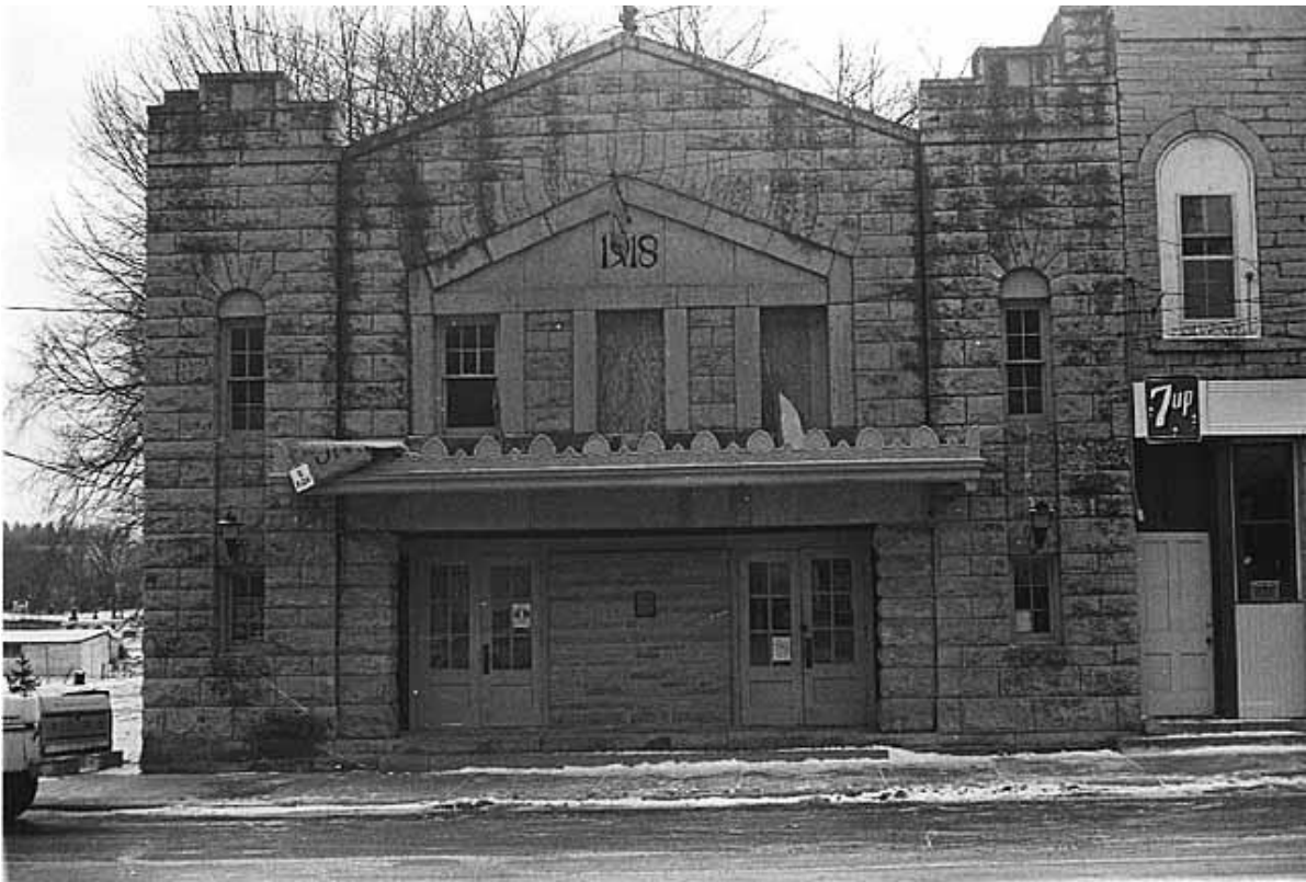
Mantorville Opera House, 1975