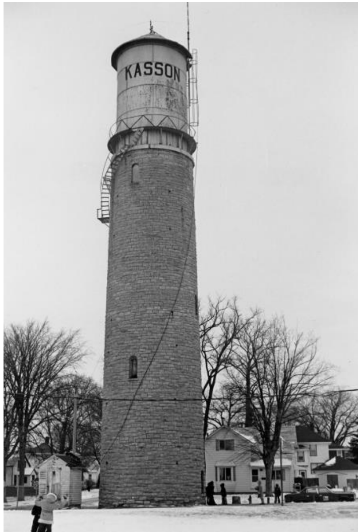
Kasson Water Tower, 1975.