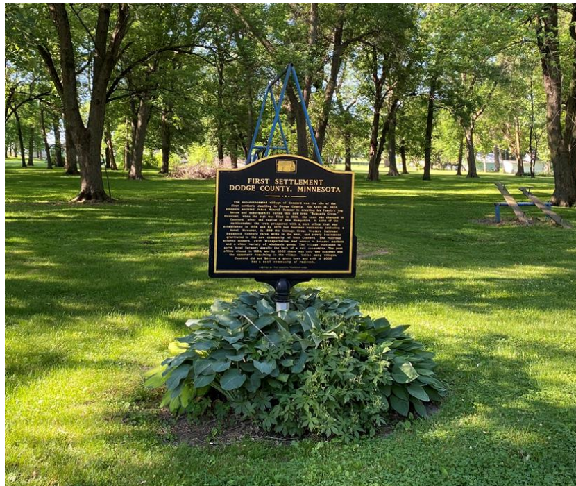
First Settlement of Dodge County plaque, 2021