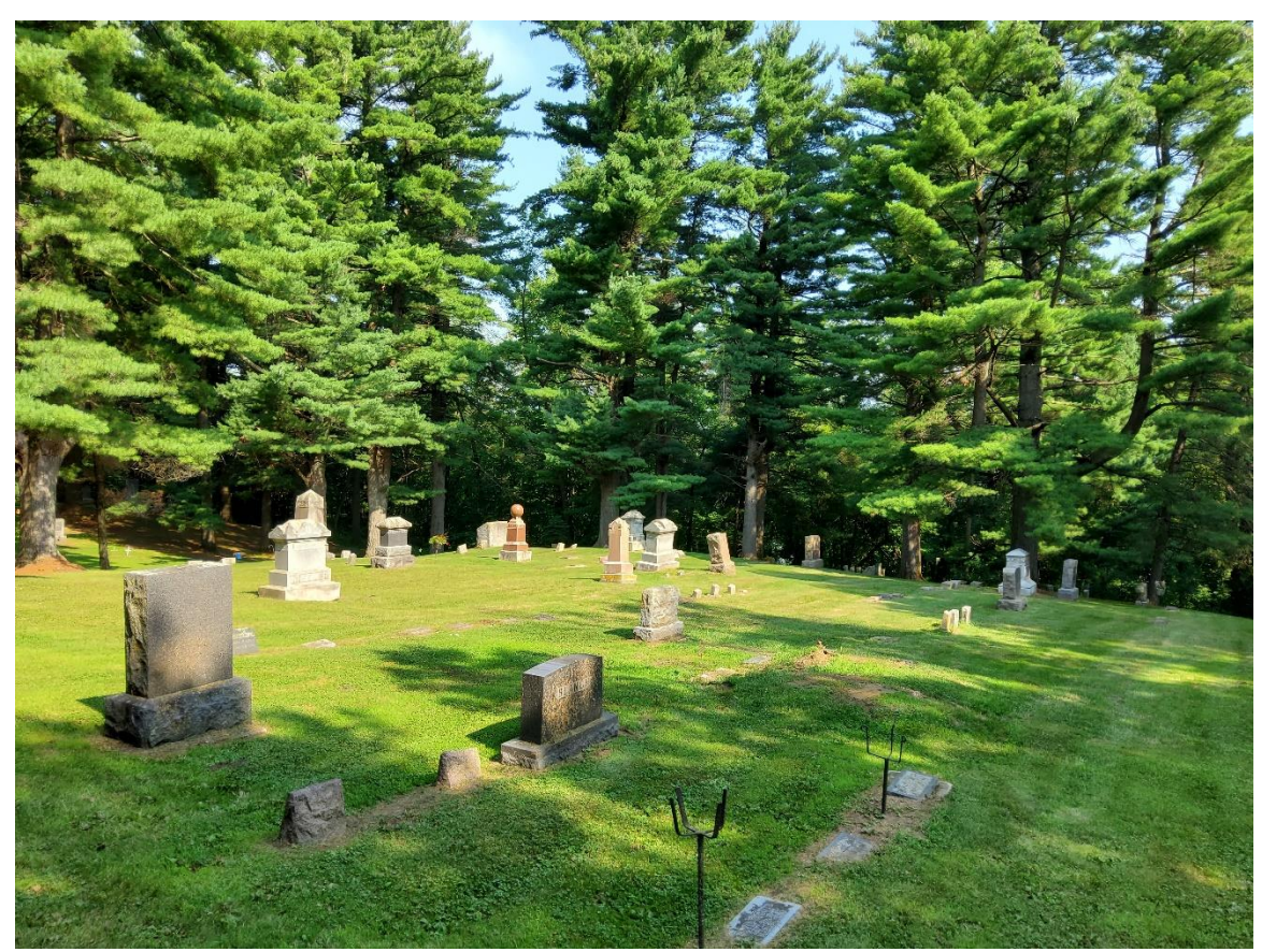
Headstones of Evergreen, 2021