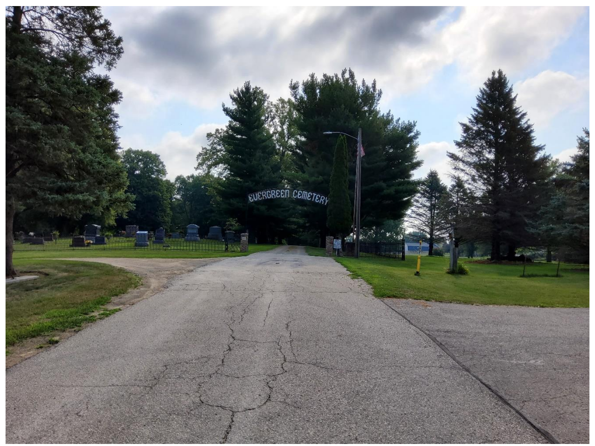
Evergreen Cemetery entrance, 2021