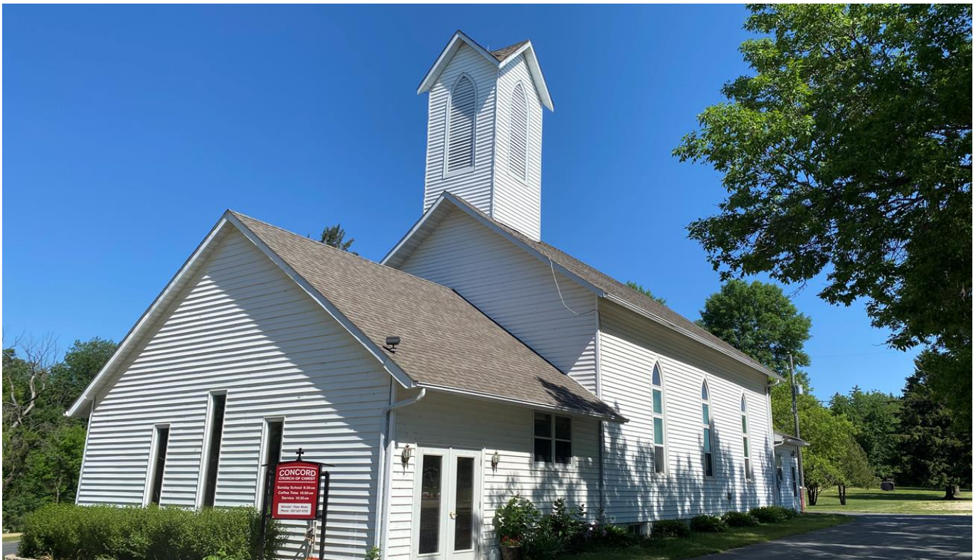
Concord Church of Christ, 2021