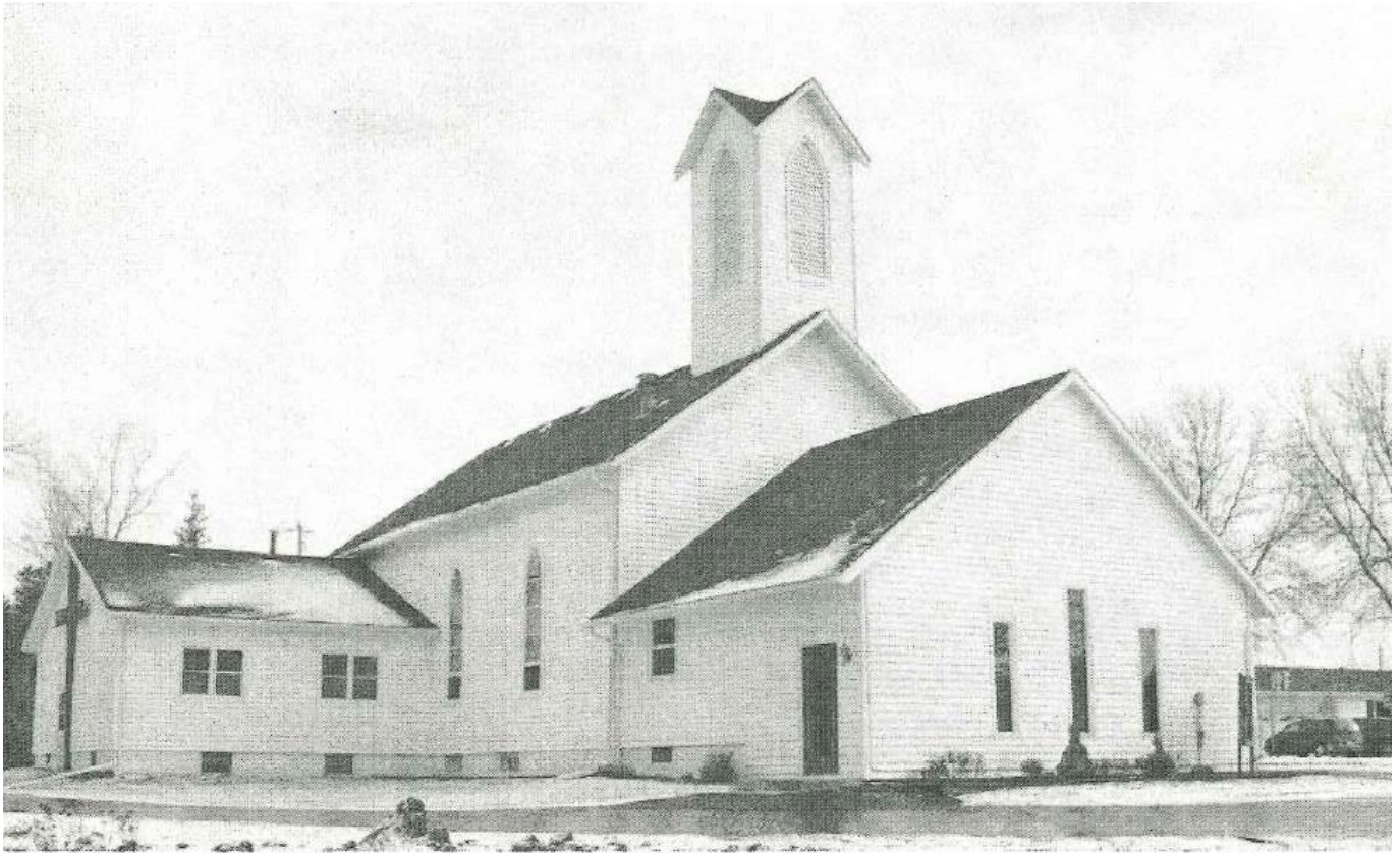
Both additions were constructed by Wheeler Construction Company of Concord. Concord Church of Christ, 2004