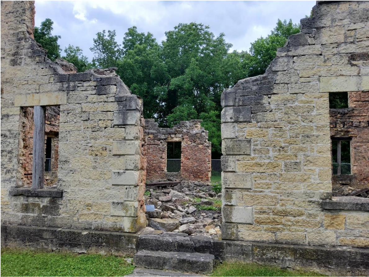
Wasioja Seminary ruins, 2021