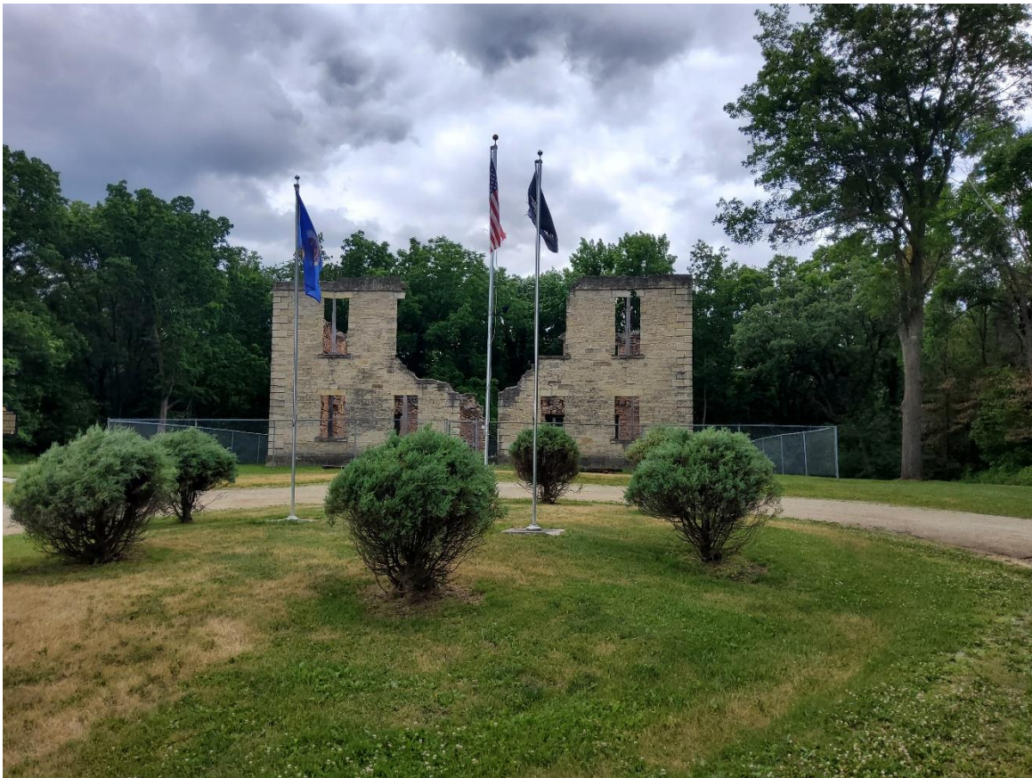
Wasioja Seminary ruins, 2021