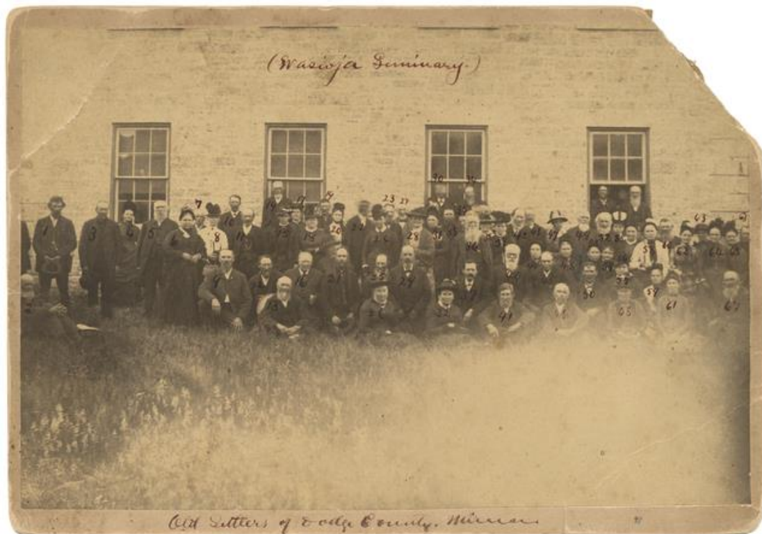
Old Settlers of Dodge County at Wasioja Seminary. ca Approximately 1885.