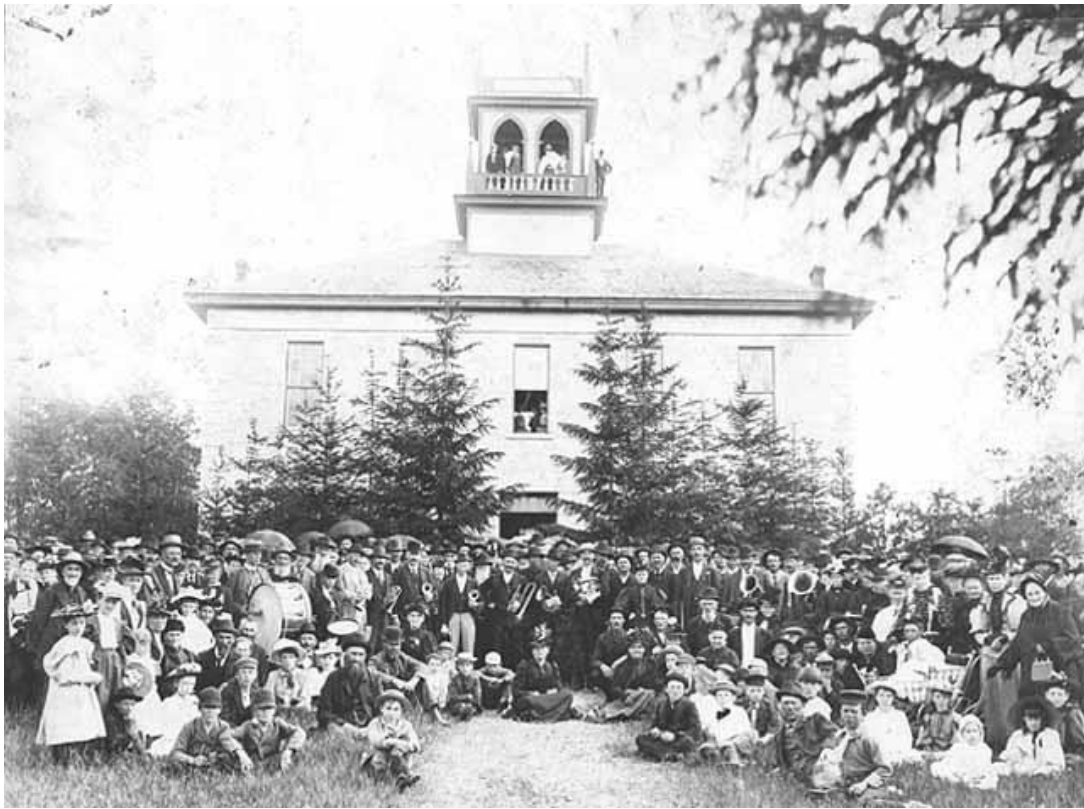
Old Settlers of Dodge County at Wasioja Seminary. ca Approximately 1890. Minnesota Historical Society, Saint Paul, MN.