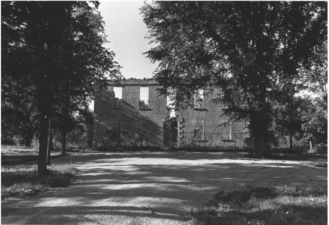
Wasioja Seminary Ruins, Wasioja. Ca. 1974.