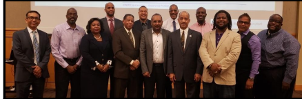
Top: PVAMU College of Business Dean's Advisory Board

Nov. 3 PVAMU vs. Jackson State (Jackson, MS); 2 p.m. Nov. 17 PVAMU vs. Alabama State (PV); 1 p.m. Nov. 24 PVAMU vs. TSU (PV); 1 p.m.