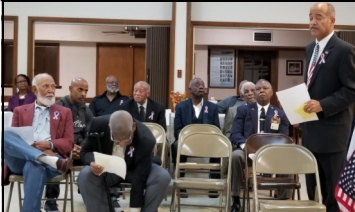
Below: PV Retired Teachers Honoring Military Veterans