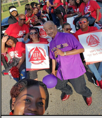
Prairie View Homecoming 2019