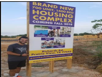
Panther Hill Apartments WE Are Rising!