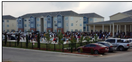
Panther Hill Apartments Students enjoy a Pool Day!