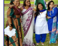
PVAMU International Day Festival

City of Prairie View City Council Meetings, April 10 & April 21, 6pm