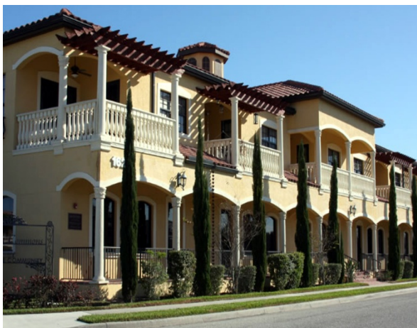
Orchid Commons in the Cape Coral CRA