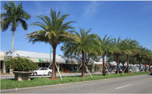
Cape Coral Parkway Median Landscaping Program