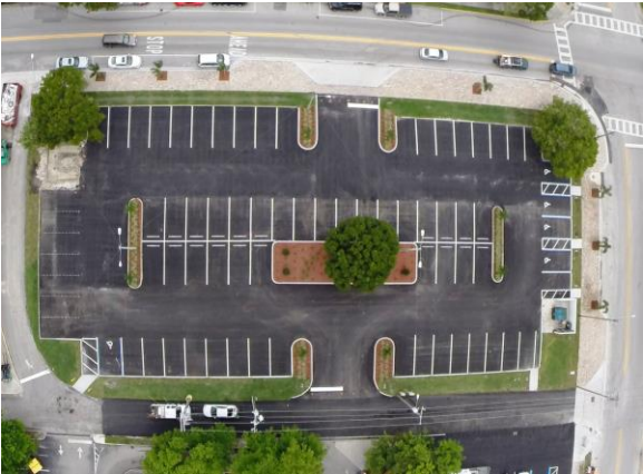
South Cape Parking Lot on SE 47 th Terrace /Streetscape Improvement Project