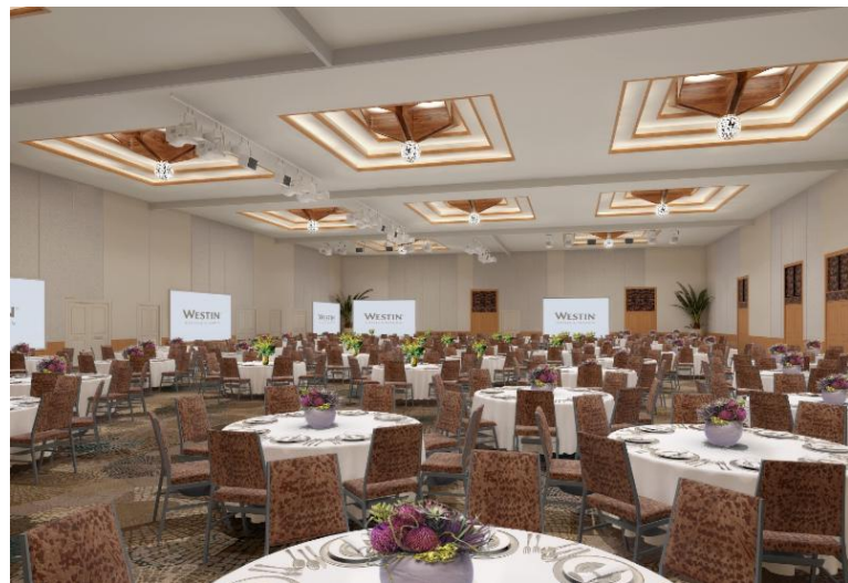
Interior rendering of the new Westin Cape Coral Resort at Marina Village meeting space.

Activity is in full swing this week as workers prepare to host their first gathering at the new Westin Cape Coral Resort at Marina Village meeting and events center. "We are excited to kick off our first event hosting over 350 guests today-- December 15. Our new event space will be a place where groups can come to collaborate, share inspiration, or