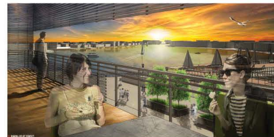
BIMINI-UP AT SUNSET

The Patio can also be home to many new community activities, including farmers markets, art walks, wine and beer tastings. "Pubs on the Patio" boat shows, fishing tournaments, award ceremonies, weddings and receptions, and so much more.