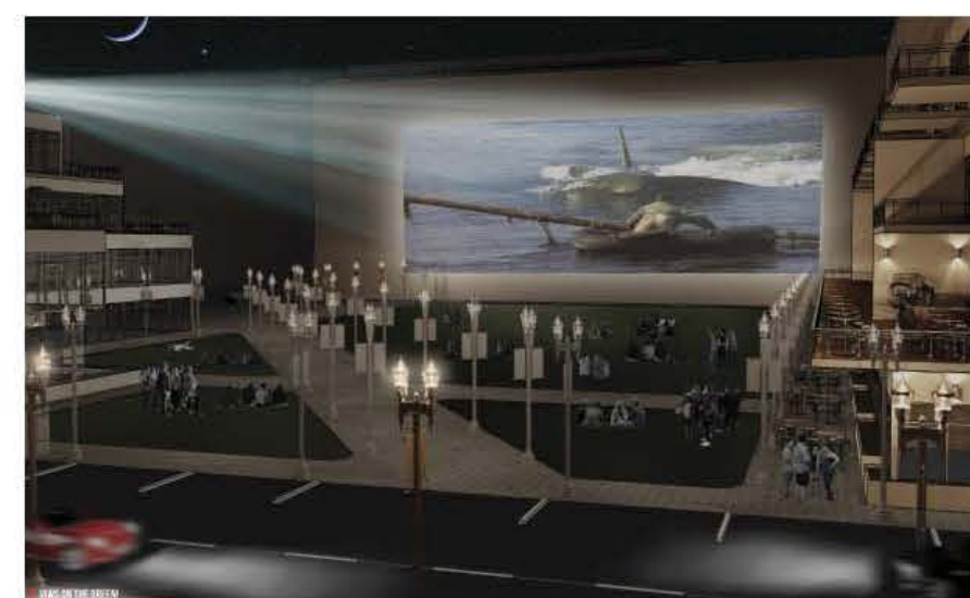
BAR ON THE GREEN