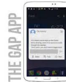
THE GAP APP