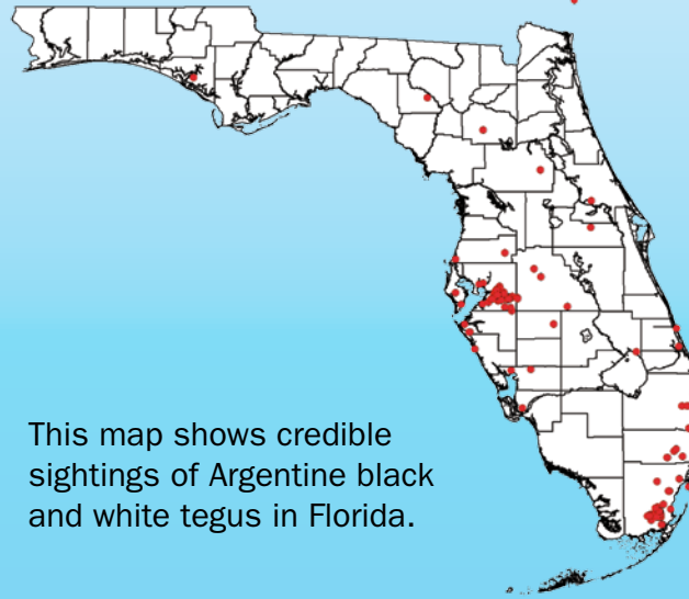
This map shows credible sightings of Argentine black and white tegus in Florida.

Local populations of breeding tegus are now known to exist in three Florida counties: Miami-Dade, Hillsborough, and Polk. Monitoring these populations and stopping the spread of this species is vital to maintaining Florida's native wildlife. Scientists are concerned that tegus will compete with and prey upon Florida's native wildlife, including some threatened species.