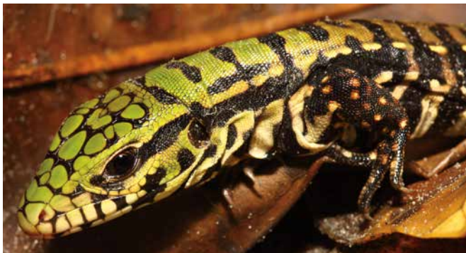
Hatchling tegus have a green coloration on their head which usually fades within the first few months of their life.