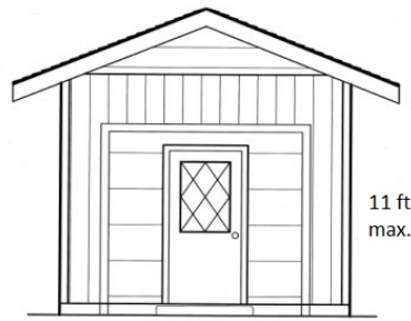
Figure 1: Sheds may be located in the rear yard of the parcel and as long as the shed is located directly behind the primary structure , screening is not required. If the shed extends into the side yard and is visible from the front of the property, screening shall be required for the part of the shed located in the side yard (see Figure 2).

Figure 2: Sheds may be located within the side yard of a parcel so long as the shed is screened with a row of shrubs, a 6 ft. tall opaque wall or fence for the portion of the shed visible from the front of the property, and the side of the shed that is nearest the adjoining side property.