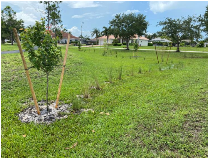
Above: Red maple (in foreground) used in a retention pond planting.

The red maple, sometime referred to as the swamp maple, is a native tree to the Southeast United States including Florida. One of the few deciduous trees found in south Florida, this fast-growing tree can reach a height of 75 feet. However, landscape varieties usually don't reach that height due to the maple's preference to wetter soils, hence the name "swamp maple". While red maples may become more majestic due to their size in zones north of USDA zone 9, dryer conditions and infrequent irrigation result in a more gradual growth rate. The density of wood in these trees make them an ideal tree for storm scaping. Healthy maples can withstand relatively high winds from tropical storms and hurricanes. Other notable maple trees are the silver maple ( Acer saccharinum ), boxelder ( Acer negundo ), and the sugar maple ( Acer saccharum ) of which maple syrup is produced from its sweet sap. Since maples are deciduous trees, leaves begin to turn red in the fall (although often delayed in south Florida) and drop during the winter months. In spring, budding begins for emerging leaves and diminutive red flowers. Once seeds begin to form, this is a sign that spring is at its peak and the seeds of red maples often whirl like helicopters to the ground. An adaptation to allow the seed to be transported farther away than the mother tree. The seeds are also a good food source for squirrels and birds.