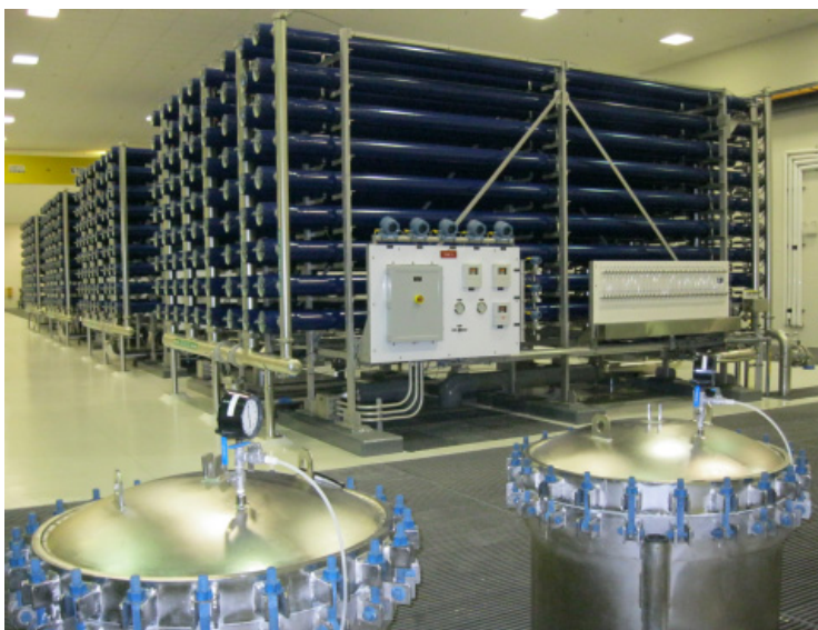
North RO Plant Production Trains

Some people may be more vulnerable to contaminants in drinking water than is the general population. Immuno-compromised persons such as persons with cancer undergoing chemotherapy, persons who have undergone organ transplants, people with HIV/AIDS or other immune system disorders, some elderly, and infants can be particularly at risk from infections. These people should seek advice about drinking water from their health care providers. EPA/Center for Disease Control (CDC) guidelines on appropriate means to lessen the risk of infection by Cryptosporidium are available from the Safe Drinking Water Hotline (800-426-4791).