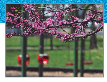
March Swing into Spring at Hunt Park

February Snowy Hillside Fun