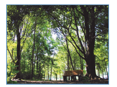
September Forest Sanctuary Amy Zylka