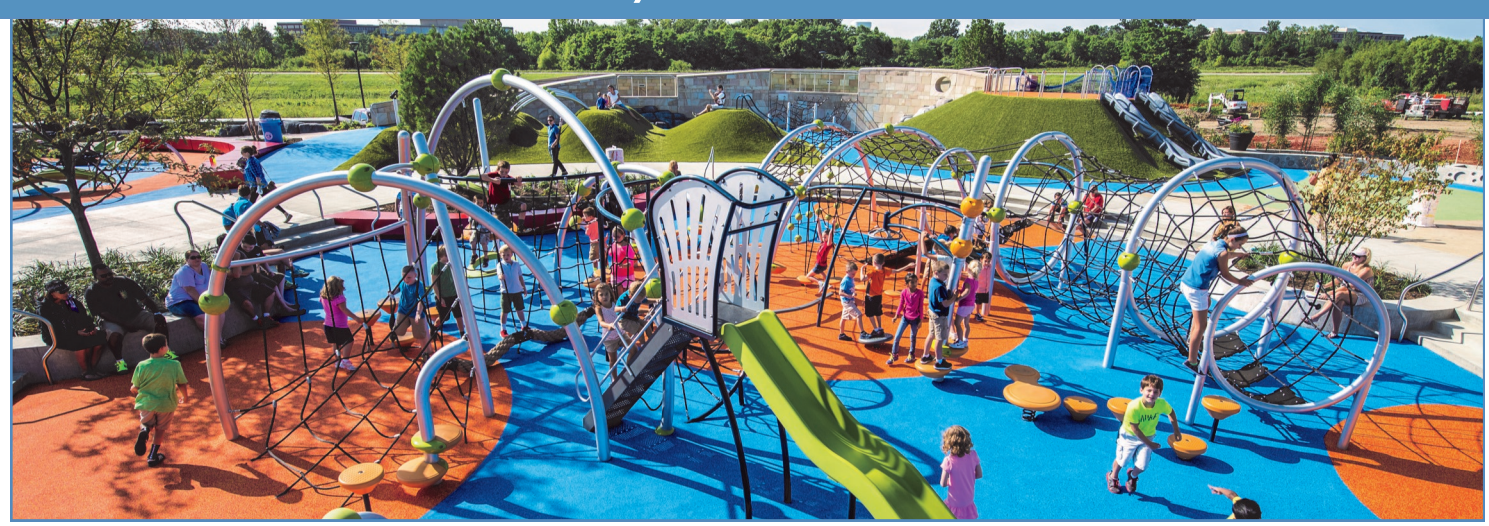
The Children's Playground at Summit Park opened on August 9, 2014 and continues to draw families from around the region.