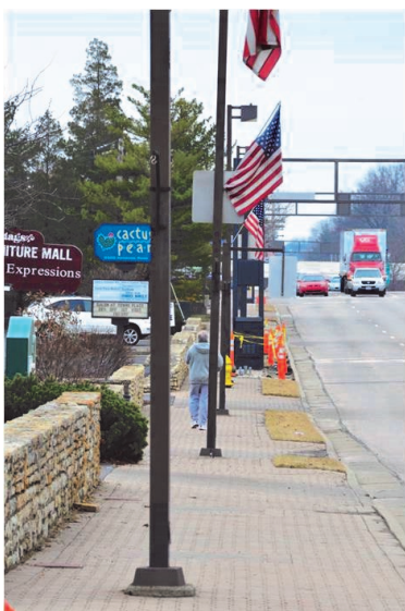
Downtown sidewalks in 2011 versus today

Over the past 8 years, downtown Blue Ash has undergone a transformation to create a more pedestrian-friendly environment, enhance aesthetics, and support outdoor entertainment and activities. The Downtown Streetscape Project began in 2010 with a focus on improving sidewalks, crosswalks, lighting, trees, landscaping and other elements. Phase 5 includes Kenwood Road from Cooper Road, south to Ronald Reagan Highway. If budget allows, this phase may also include a decorative wall at the southwest corner of Kenwood and Cooper Roads. There are three additional phases anticipated.