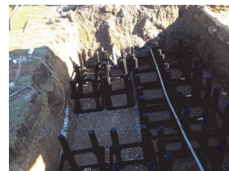
Underground silva cells

Many of these changes were necessary to remain in compliance with the Americans with Disabilities Act. The project is also environmentally-conscious and incorporates silva cells to promote healthy street trees. The silva cell system, which is underground, allows the trees to grow roots past the cell itself instead of being confined. The cell system is also topped with pervious concrete, allowing the storm water into the ground to provide natural filtration.