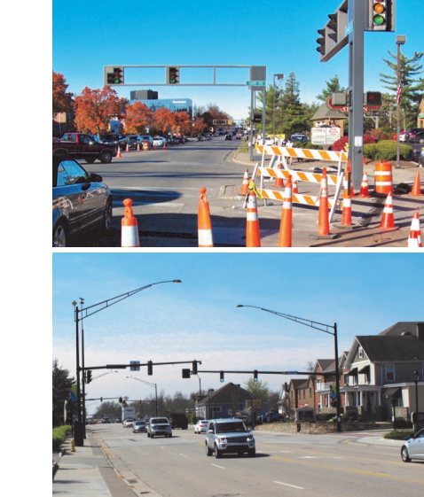
Downtown traffic signals in 2011 versus today

Here is a look back at some of the changes in celebration of the start of Phase 5: