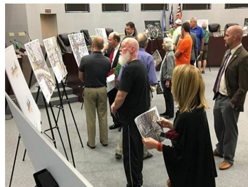
The Roundabout Open House at Blue Ash Council Chambers

A June 18th Public Works Department Open House regarding roundabouts was well attended with many citizens asking important questions and giving insightful feedback on the project.