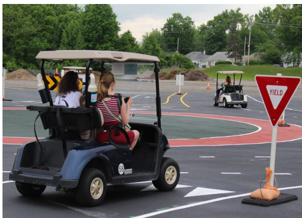
The golf cart roundabout course at Summit Park

Meanwhile, a golf cart-sized roundabout course, created in a parking lot at Summit Park, has been an educational and fun way for residents to learn how to drive on a multi-lane roundabout.