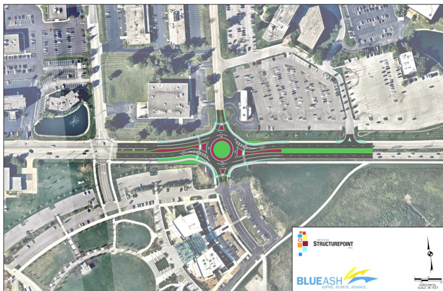
StructurePoint rendering of a roundabout being constructed by Al. Neyer near Summit Park.

Four roundabouts will be constructed in the coming years in Blue Ash and the city is committed to providing educational outreach, events, and programs to keep citizens informed.